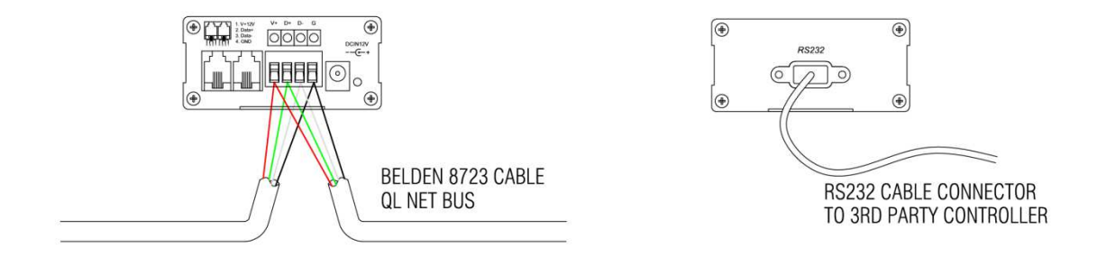
Fig 2. Module Connection