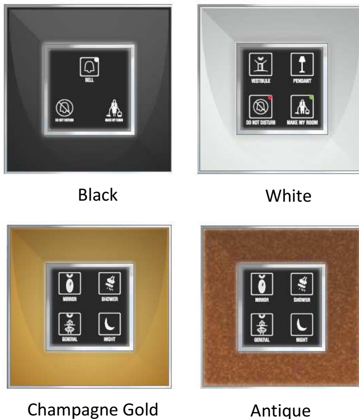
Fig 2. Standard Available Finishes