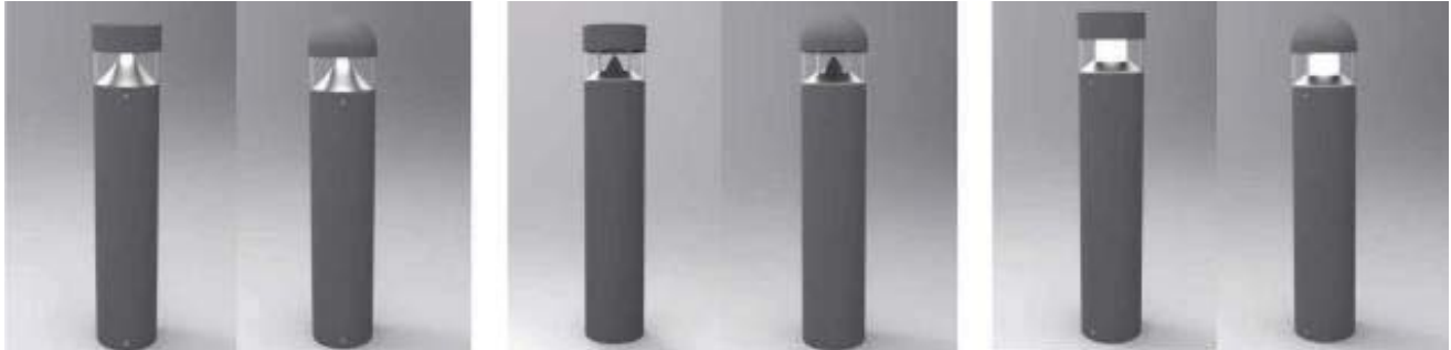
QL Y JA03BCE-80-V2 QL Y JA03BCE RH-80-V2 QL Y JA03BCF-80-V2 QL Y JA03BCF RH-80-V2 QL Y JA13BCF-80-V2 QL Y JA13BCF RH-80-V2