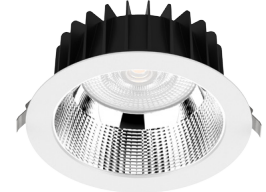
Bright silver reflector