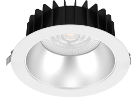
Matt silver reflector