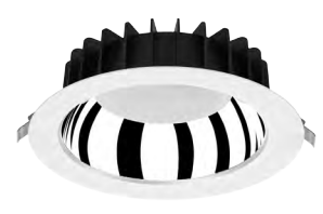
Bright silver reflector