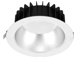
Matt silver reflector