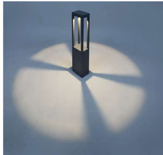
QL Y BJB-4S Series