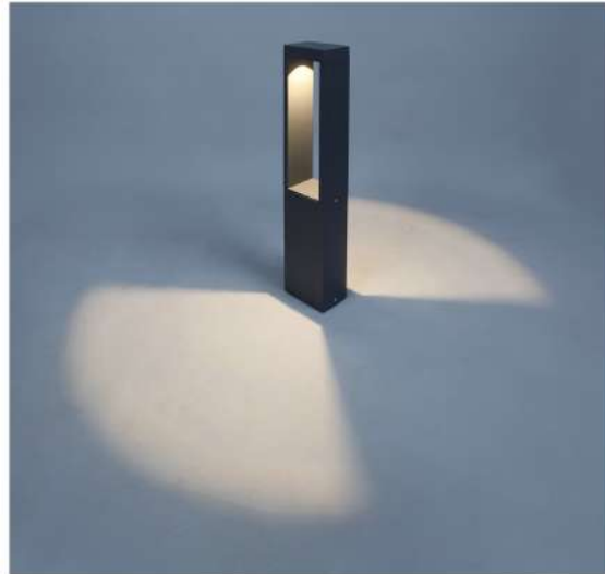
QL Y BJB-2S Series